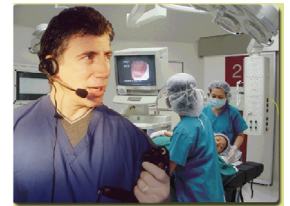
say it... see it...